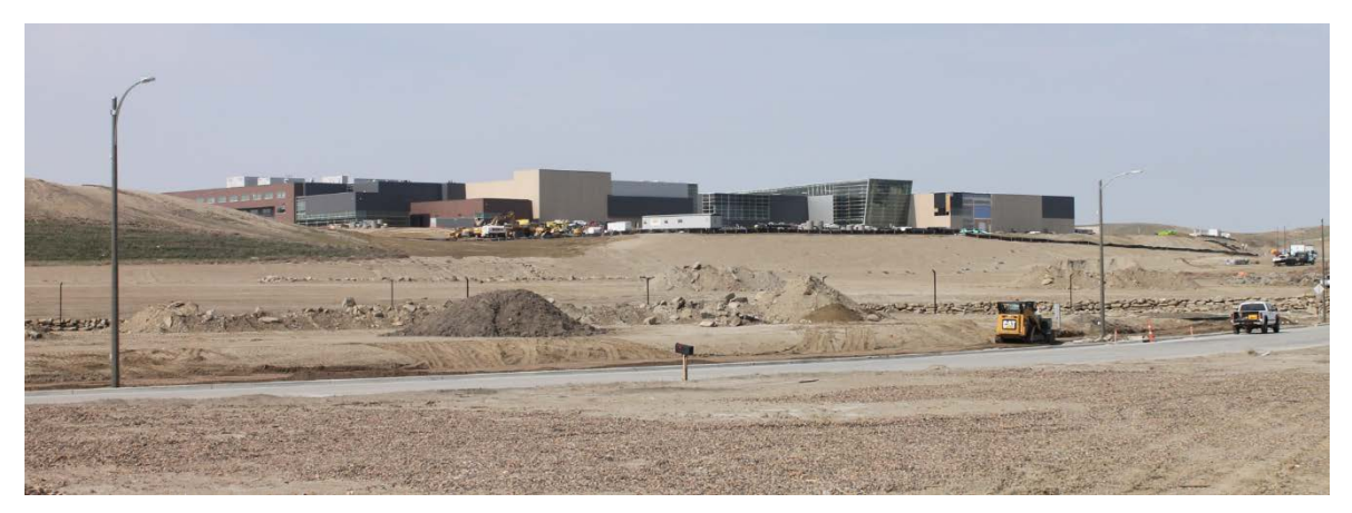
FIGURE 2. A NEW $50 MILLION HIGH SCHOOL NEAR WATFORD CITY, NORTH DAKOTA

As noted above, Colorado schools had compounding reasons to be concerned with long-term school financing other than simply the oil and gas busts. Pennsylvania districts faced similar uncertainty due to a bitter and prolonged state budget battle that left some schools within weeks of closing their doors. In both cases, as well as in eastern Ohio districts, declining production-based revenue exacerbated the common stress of financial security. In a broad sense, this uncertainty refrain calls into question the design of school funding mechanisms and to what extent they restrict administrators from optimizing financial strategies.